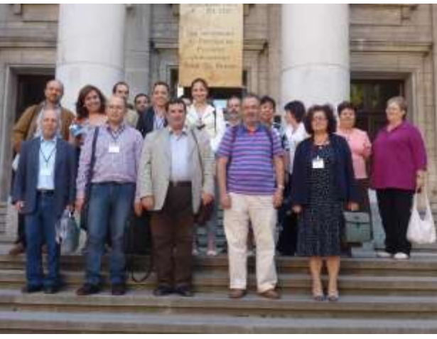
The Department of Mathematics cooperates with other research institutions working in the area of Mathematics such as the Institute of Mathematics and Informatics at the Bulgarian Academy of Science and departments from other universities on national and international level.